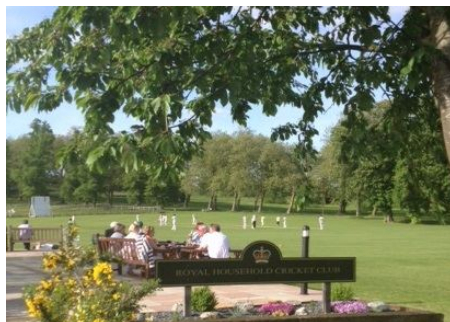
Cricket at Windsor Castle

The fixtures for the tour have just been finalised. Looks like it will be one of the youngest teams ever to have travelled with the Crusaders. It should be a great tour. The itinerary is detailed in full on the next page of this newsletter.