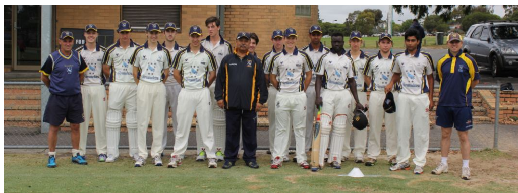
The 2014-15 Crusader Youth Test Match Team

Encourage first to be a champion person and second to be a champion player